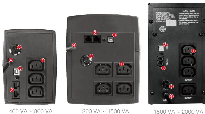
400 VA ~ 800 VA